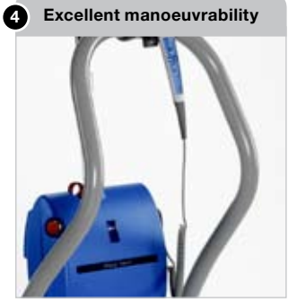
The twin-mast design distributes the resident's and lifter's weight more evenly, which makes turning easier. It also offers an ergonomic grip for smooth manoeuvring that can be used efficiently by carers of all heights.