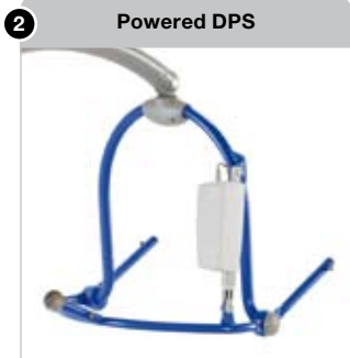
The Powered DPS spreader bar offers effortless, exact positioning of the resident at the press of a button.