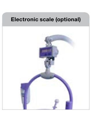
A vertical electronic scale is offered as an optional extra. It allows the carer to conveniently weigh their resident/patient while performing a transfer.