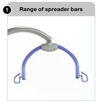
With a choice of 3 different loop spreader bar sizes, Medium DPS and Medium Powered DPS, a range of options is available to provide the optimized solution for patients with unique needs. To be specified at the time of order.