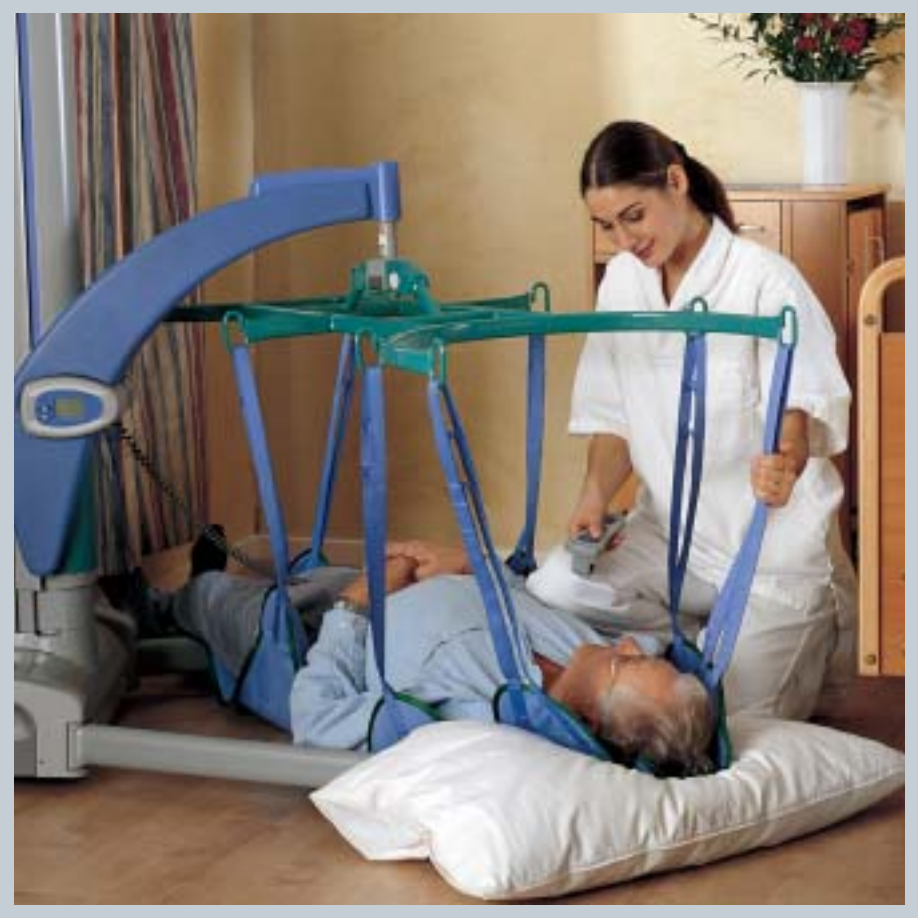
Straight answer: If required, a patient can be lifted from the floor in a fully supported horizontal position, using the soft stretcher.