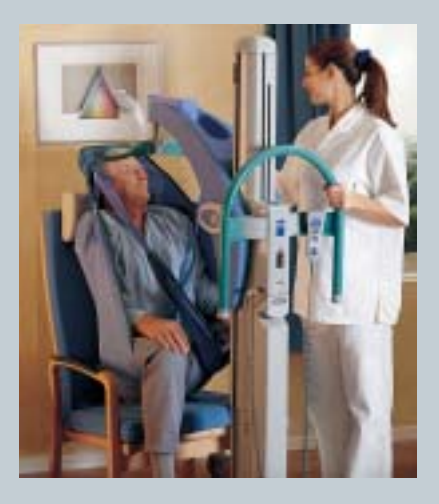
The Opera can be used with a four-point tilting spreader bar, two-point spreader bar or stretcher frame.

Option Two: A lightweight two-point spreader bar enables the use of ARJO loop slings or Walking Jacket .