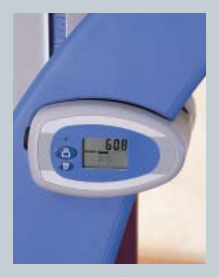
Weigh as you transfer: The optional built-in electronic scale increases overall efficiency by allowing accurate weighing of the patient during a transfer.

• Scoop stretcher Applicable when a more rigid lifting surface is required.