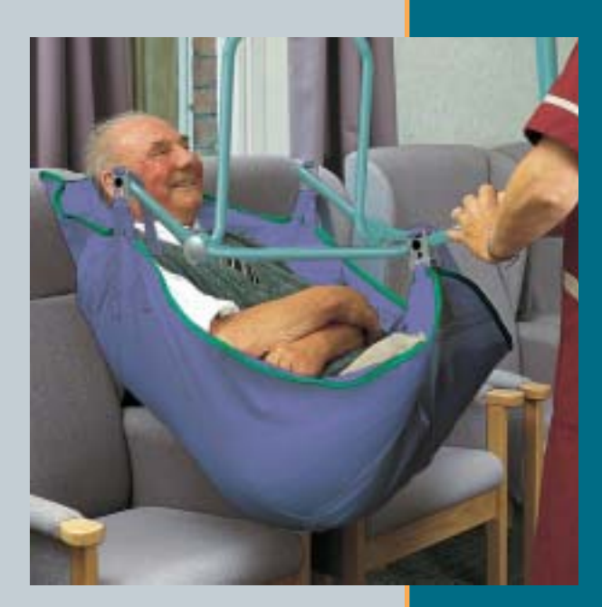
Sling for double amputees: This four-point sling has closed leg pieces to facilitate the safe lifting of a double amputee.