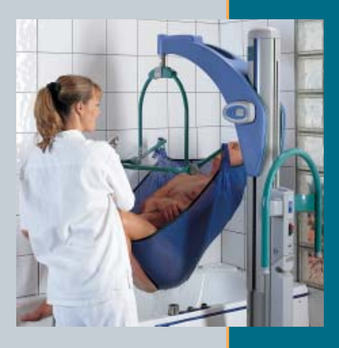
Bathing sling: Opera and mesh sling in use with an ARJO height-adjustable bath.